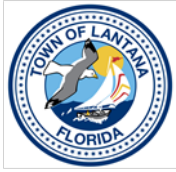
Exhibit D – Budget-In-Brief