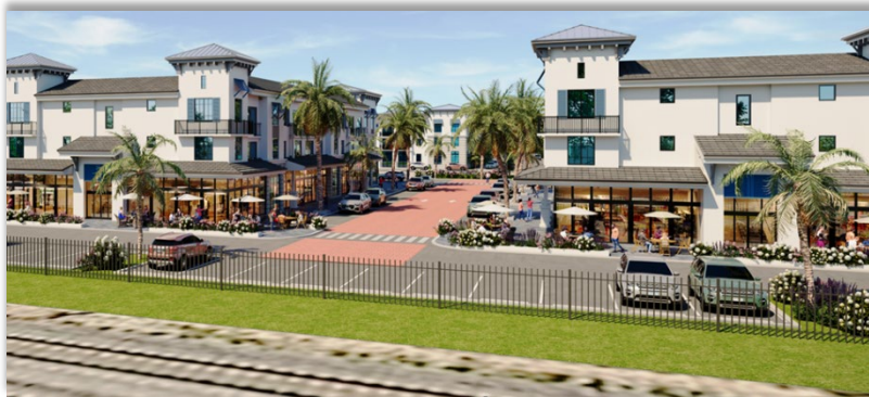
Rendering of Lantana ParkSquare as seen from the FEC Railway

In April 2023, Integra Solutions, LLC (Integra) purchased the 18-acre site located at the corner of Hypoluxo Rd and Dixie Hwy, commonly referred to as the vacant Kmart site. Since that time, staff has been collaborating and coordinating with Integra's development team to deliver a well-planned mixed-use development and vibrant space that will enhance the site's visual appeal and address the community's diverse needs. On 02/12/2024 a public workshop was held whereby Integra presented the site's conceptual site plan and renderings (as currently drafted). During the workshop, the Town Council provided positive feedback on the project's conceptual plan, commending its thoughtful design and alignment with the community's vision and Master Plan. Overall, the Council's endorsement (through consensus), signifies confidence in the project's potential to breathe new life into the community's fabric. In addition, the public was given the opportunity to ask questions and provide comments. As a result, staff has moved forward with next steps, including both text and Comprehensive Plan amendments before proceeding with the Special Exception, Site Plan and Landscape Plan applications. For more information regarding the materials that were presented at the 02/13/2024 workshop (e.g., Site Plan, Renderings and PowerPoints), please contact Town Administration at (561) 540-5004.